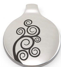
NEW “Koru” Pendant

This gorgeous showcase of “smart engineering meets elegant jewelry design” comes in a sleek, black case, which holds 3 brand new stainless steel GIA4Life Pendant designs, an ERT-charged “Flexcore” insert, and a GIA4Life key.