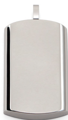
NEW “Tag” Pendant