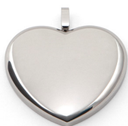
NEW “Heart” Pendant